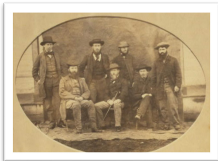
Oregon Boundary Commission, 1858

environment have learned to genuflect to “experts” so long as those experts express views with which they already agree. They also respond with hysteria rather than reasoned and iterative deliberation in the face of risks and threats. They have little understanding of their actual rights as practiced, while often parading in the streets to protect rights that they perceive as under threat. And they are all too happy to consign the American way of life to the dustbin in search of some new anti-capitalist utopia. I wrote a policy brief criticizing Governor Brown’s executive order on precisely those grounds. The Governor is acting like a Dean of Student Life, sheltering fragile Oregonians from mostly non-existent threats with safe spaces and clampdowns on basic rights. Oregonians are about to find out how much they miss capitalism when the bills come due. COVID-19 is not just a challenge for American higher education, it is a reflection of it. That is why the NAS report Critical Care is so timely. To prevent another catastrophic policy mistake that acts out of fear and hysteria, costing far more lives than it saves, we need to rebuild the foundations of the American citizenry through higher education. The photos in this month’s newsletter fit that bill nicely: they are of hard-working Oregonians around the second half of the 19 th century, a reminder of the pioneer spirit that may flicker yet somewhere in the heart of our state.