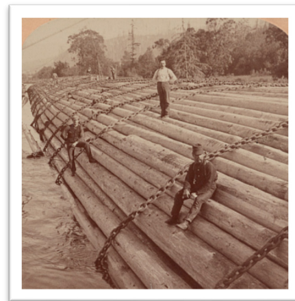
Oregon Log Raft, 1902

question of public monies returns to the agenda as a result of COVID-19, we as scholars and concerned members of the public should use the opportunity to shine a light on whether taxpayer funds in Oregon are being used to advance or retard the principles to which our public universities profess attachment.