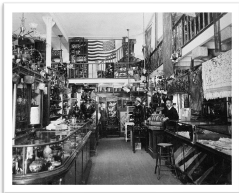
Andrew Kan & Co. Store, Portland, 1890